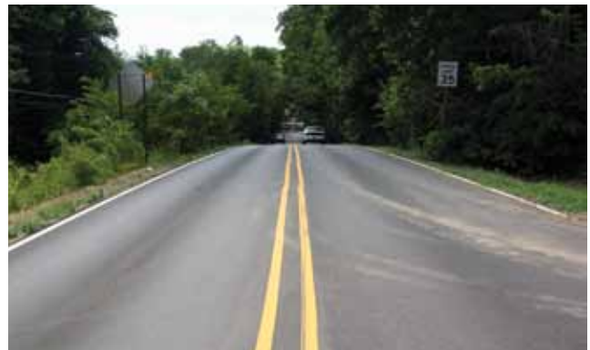
After RebuildIndy improvements.

(317) 327-2656 • www.indy.gov/RebuildIndy