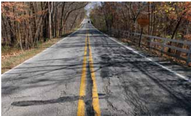
Crumbling infrastructure near the 86th Street and Lafayette Road intersection before resurfacing.